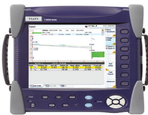
Scalable platform for multiple-layer and multiple-protocol testing