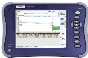
Compact multilayer platform for network installation and maintenance